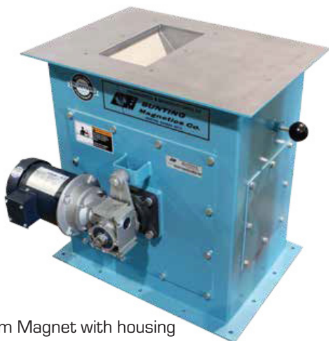
Drum Magnet with housing